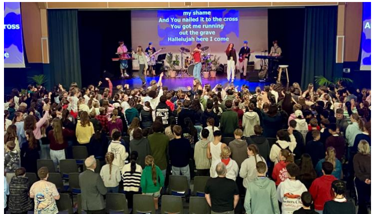
Worship at the Y7-10 Middle School Conference