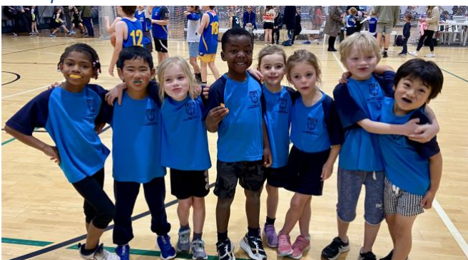
Year 1&2 Liberton Nuggets had great fun at their basketball game this week.