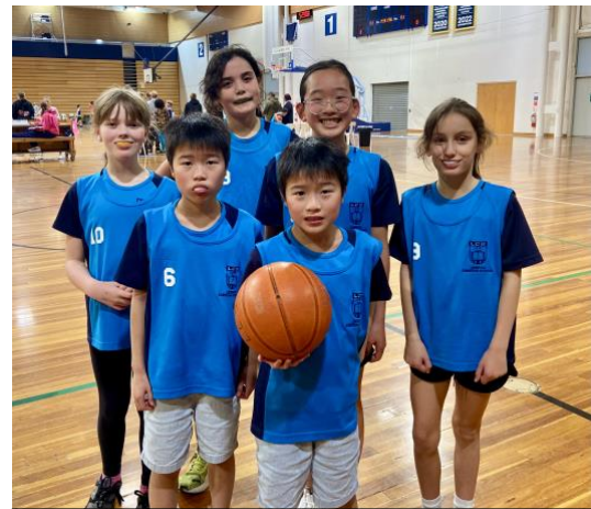
Our Y5&6 Liberton Clippers basketball team played a great game on Thursday.