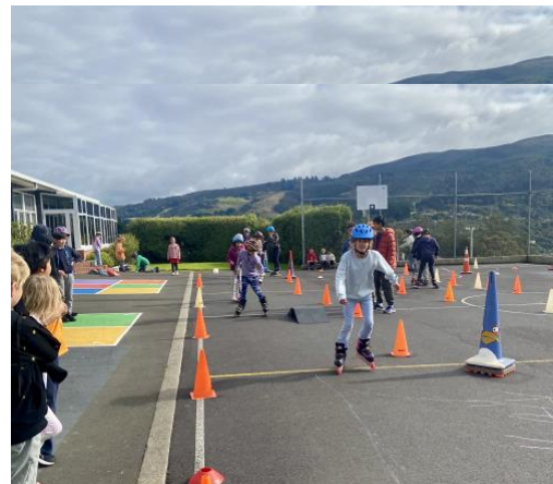
Wednesday Wheels Day fun.