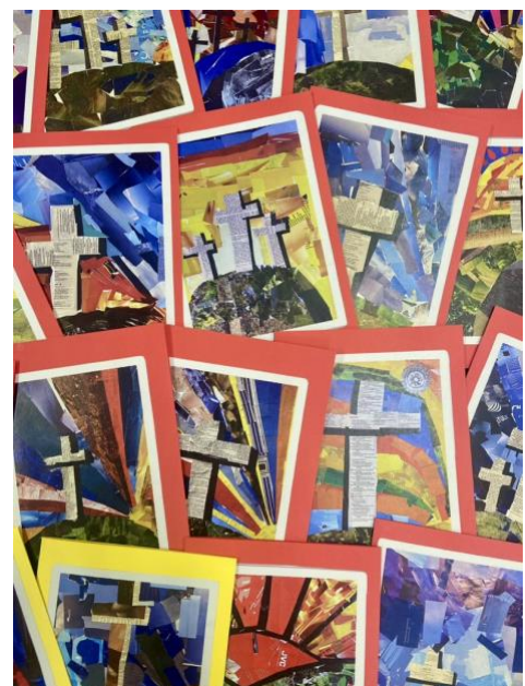
Y5&6 Easter card creations

20 April First day of term 2 21 April EPro8 Y7&8 interschool competition 23 April World Vision Youth Conference 23 April Y1-6 swimming @ Moana Pool 23 April EPro8 Y5&6 interschool competition 27 April ANZAC Day (school closed) 30 April Y1-6 swimming @ Moana Pool 7 May Y1-6 swimming @ Moana Pool 14 May Y1-6 swimming @ Moana Pool 21 May Y1-6 swimming @ Moana Pool 23 May Liberton PFA cheese roll making day 25 May You've Got the Power show 28-29 May NZACS Leaders Conference 1 June King's Birthday (school closed) 4-5 July Y7-10 Middle School Conference @ Hillview 19 June World Vision 40 Hour Challenge weekend 3 July Last day of term 2