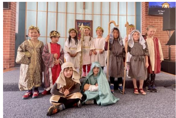
Photo: 2024 Nativity play

Our graduation assembly will commence at 1.30pm on Thursday 11 December. This is a whole community event. Our Year 8 graduates will present their farewell speeches and receive their graduation certificate. Our Room 2 students will present their Nativity Play. Afterwards there will be an afternoon tea in the hall for whānau and an ice block outside for students and younger siblings. Please join with us to celebrate our graduating students and enjoy fellowship together.