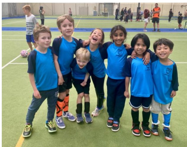
Photo: This happy crew are the Year 1&2 Liberton Flames futsal team.

Coaches and managers, we would love to thank you at assembly next week. Please attend if you can!