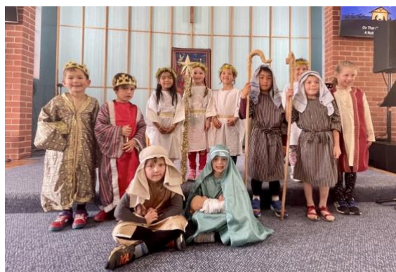
Photo: 2024 Nativity play

Our graduation assembly will commence at 1.30pm on Thursday 11 December. This is a whole community event. Our Year 8 graduates will present their farewell speeches and receive their graduation certificate. Our Room 2 students will present their Nativity Play. Afterwards there will be an afternoon tea in the hall for whānau and an ice block outside for students and younger siblings. Please join with us to celebrate our graduating students and enjoy fellowship together.