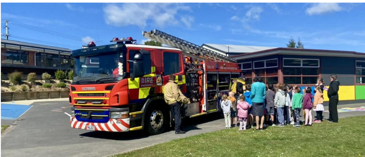
Photo: The junior classes learning about the fire truck equipment.