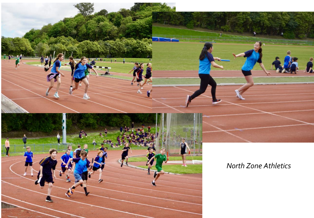
North Zone Athletics

We keep a supply of spare clothes (undies, pants, tops) at school for when our junior children need a change. We gave out most of our supply last term and haven't received it back! Please return school clothing so it is ready for the next time it is needed.