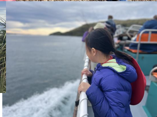
Scenes from the service group project events.