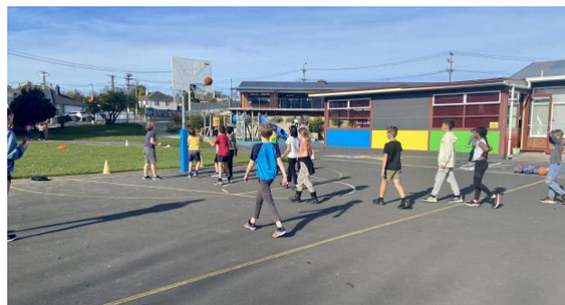
PHOTO: Lunchtime basketball practise