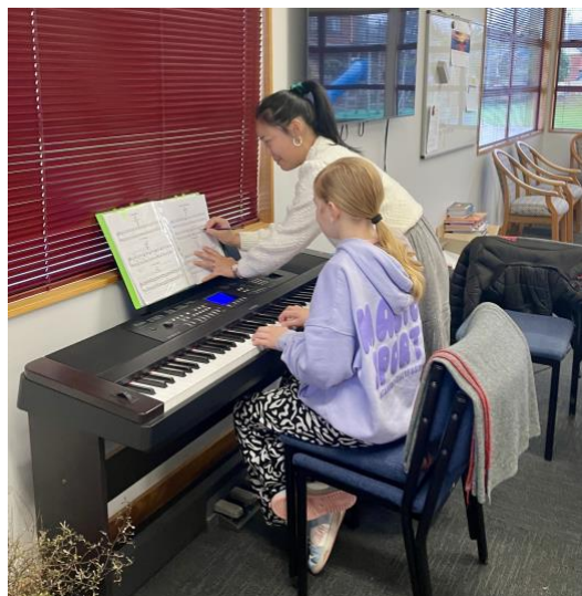
PHOTO: Mah music lesson at school