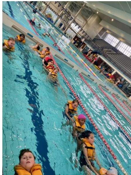
PHOTO: water safety lessons at Moana Pool