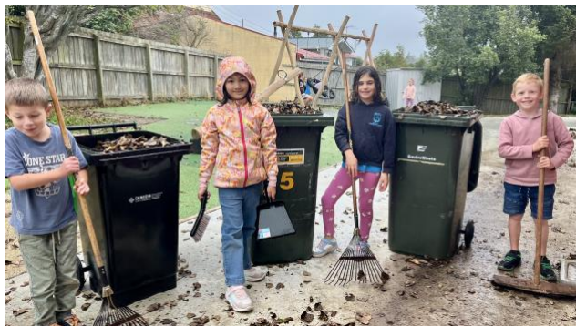
PHOTO: Wonderful volunteers helping to clean up the leaves from the big winds on the first day of term!