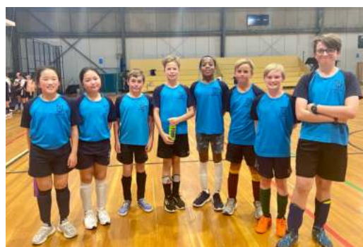
Liberton Lightning Y7&8