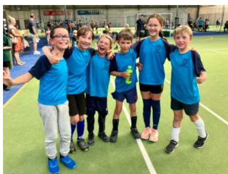
Liberton Legends Y5&6

Our teams are playing well and enjoying the competition. A big thank you to the wonderful parents who are helping courtside with subbing and team management. We know it can be challenging keeping up with the late changes and organisation. Well done to you all!