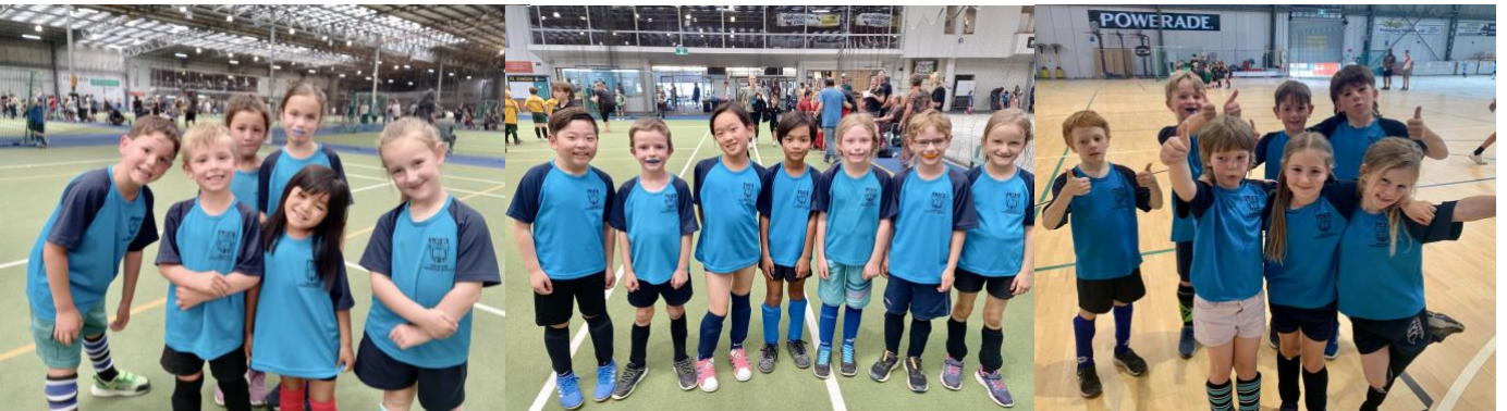
Liberton Strikers Y1&2

Futsal is played on Tuesdays (Y1-4) and Wednesdays (Y5-8) after school.