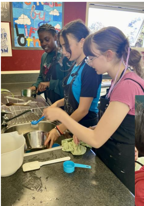
Y7 students in Food Tech and Digi Tech at DNI Technology

In Christ are hid all the treasures of wisdom and knowledge. Colossians 2v3