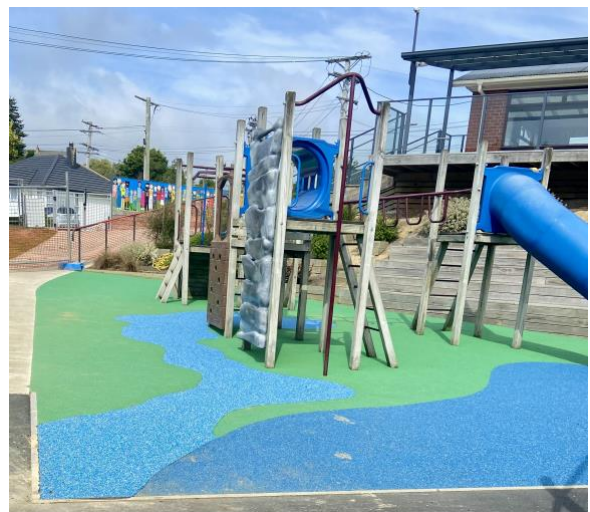
We now have a nice blue river on the playground mat!