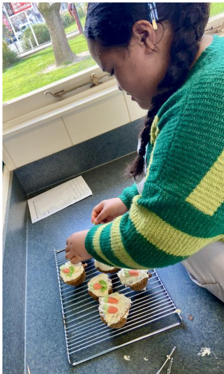
YEAR 7&8 FOOD AND SOFT MATERIALS TECHNOLOGY THIS WEEK

Thank you for helping keep all students safe at the school gate at 3pm. Please do not park on the yellow lines or over the main gate area. We continue to remind our junior children (Years 1-4) that they must not leave the school grounds without an adult or older sibling alongside them.