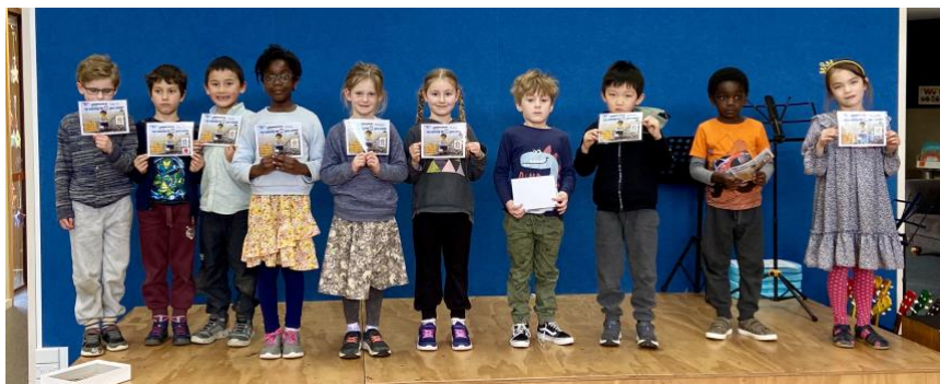
Year 1&2 LCS Cross Country 1 st , 2 nd , 3 rd certificates.