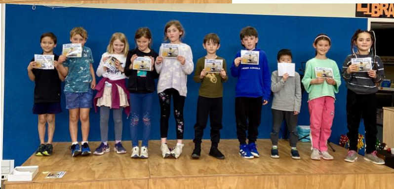
Year 3&4 LCS Cross Country 1 st , 2 nd , 3 rd certificates.