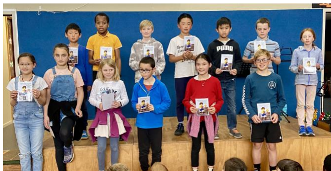
LEFT: Well done! Our North Zone Cross Country participants received their certificates in assembly last week.