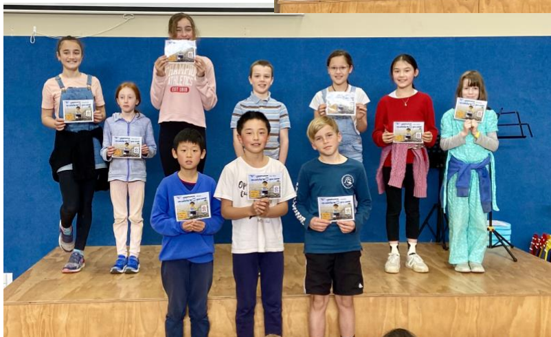
Year 5&6 LCS Cross Country 1 st , 2 nd , 3 rd certificates.