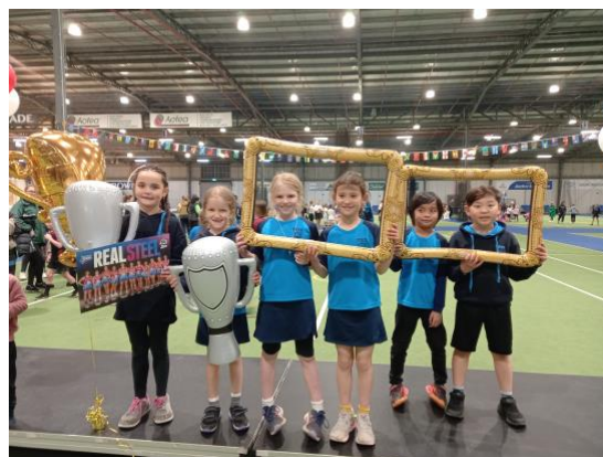
RIGHT: The year 3&4 netball team after their final game of the season last week.