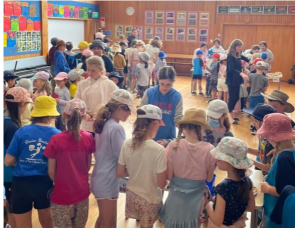
RIGHT: The Bake Sale