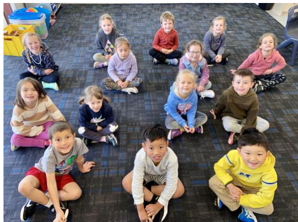
The lovely Room 2 class.