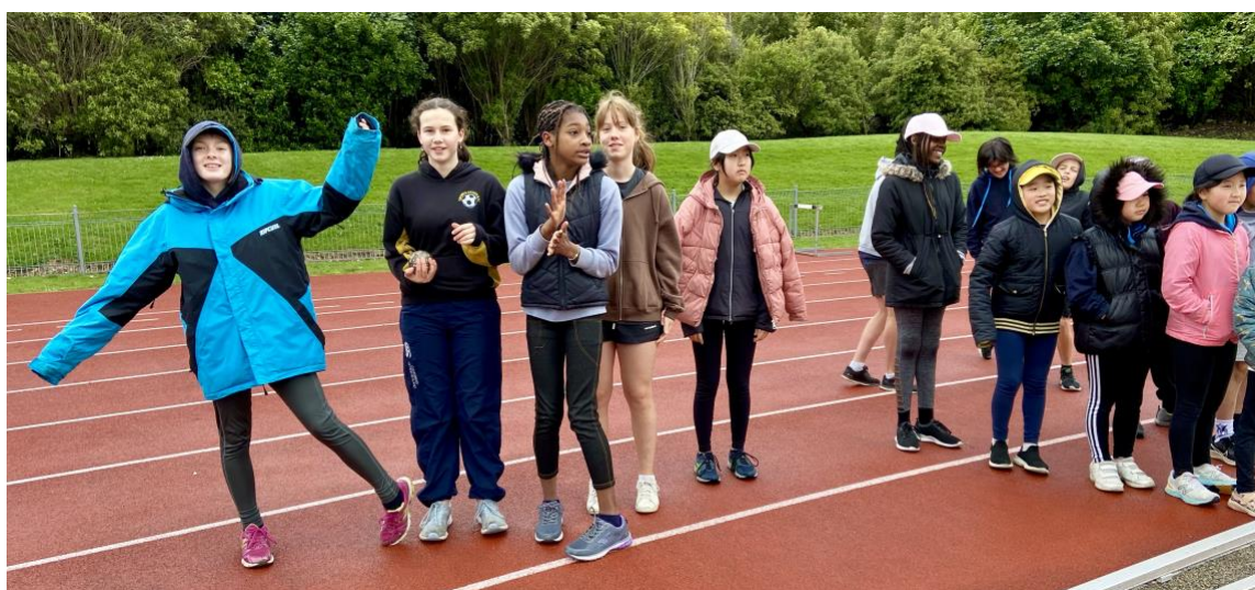
It was a cold start to our athletics day...