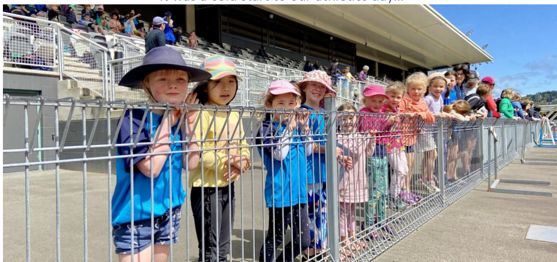
...but it did warm up!