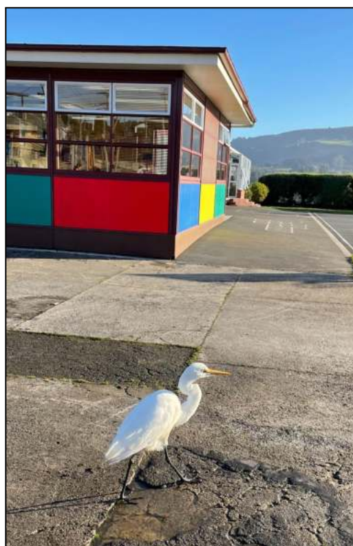
Grant Peacock Acting Principal