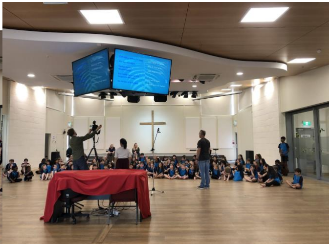
Lights, camera, Action!