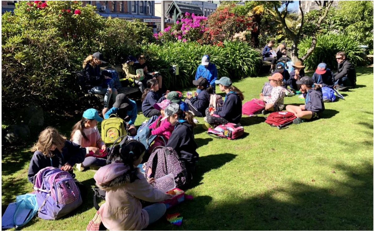
Room 4 enjoying a break during their walk to learn about the scale of the sun and planets on Thursday. They walked from the octagon to school on a perfect morning.