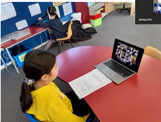
Left: LCS onsite bubble learning