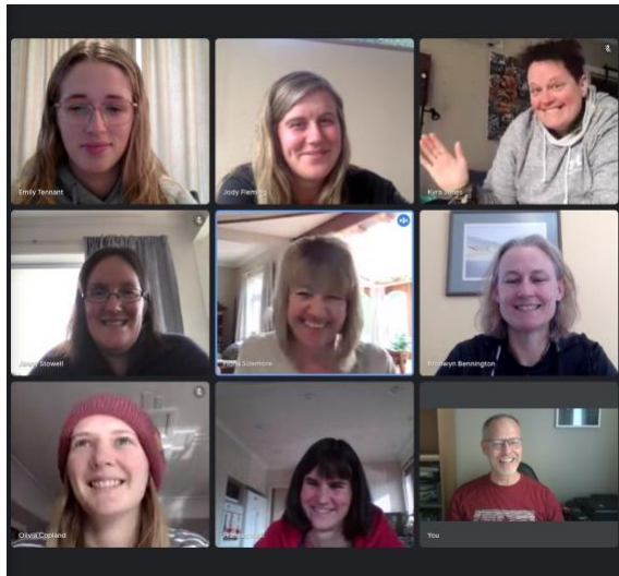
Online staff meeting

Below: home-learning packs and devices ready for contactless pick up