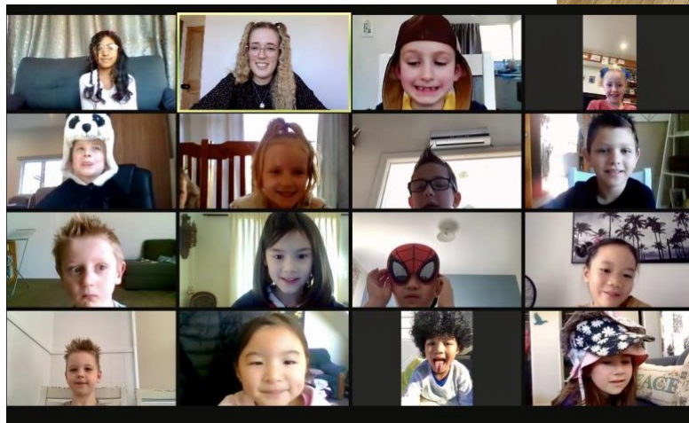
Left: Room 3's wacky hair/hat zoom.