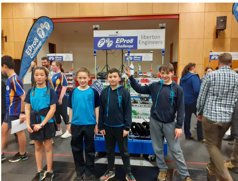
Our Year 7&8 EPro8 team Liberton Engineers at the semi-final last week