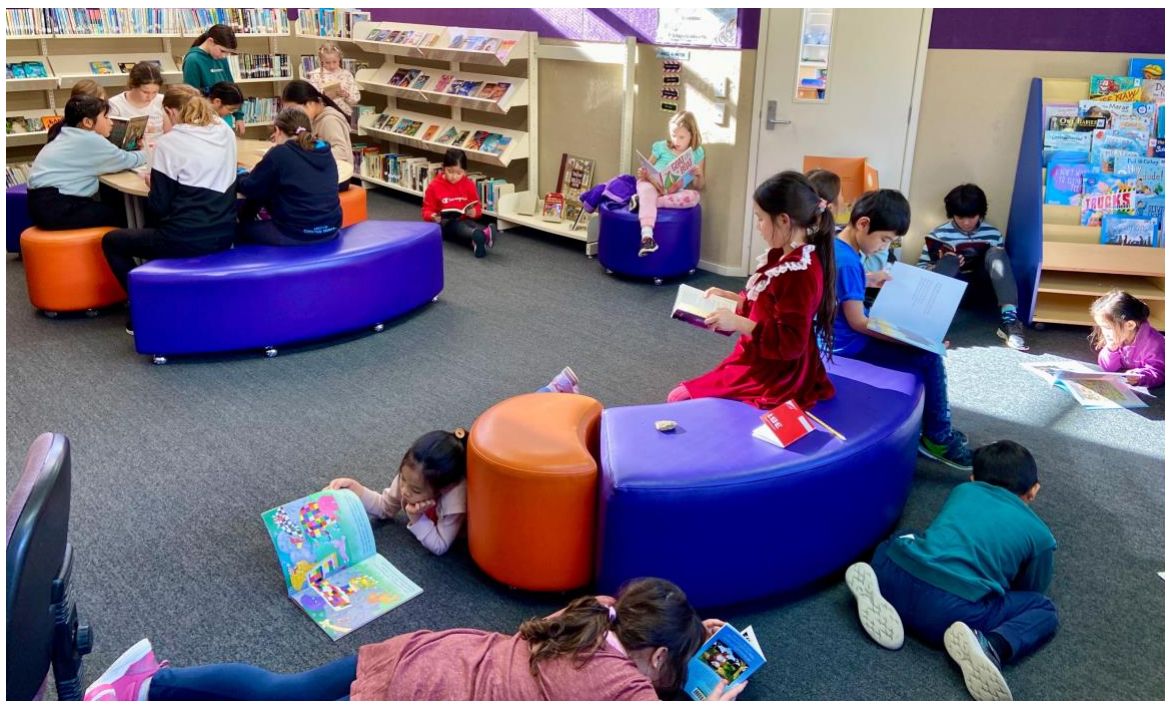
Our library is open each day at 1pm