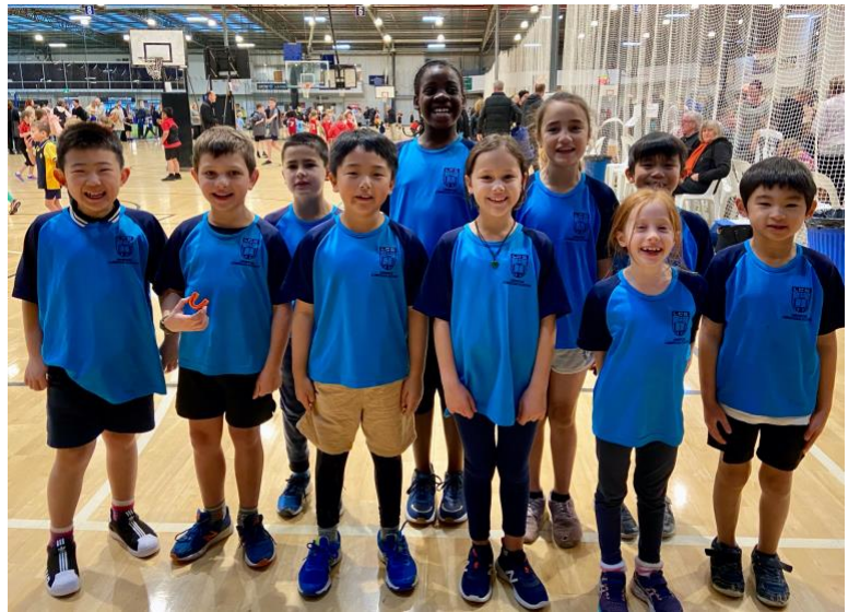
Year 3&4 Basketball Team