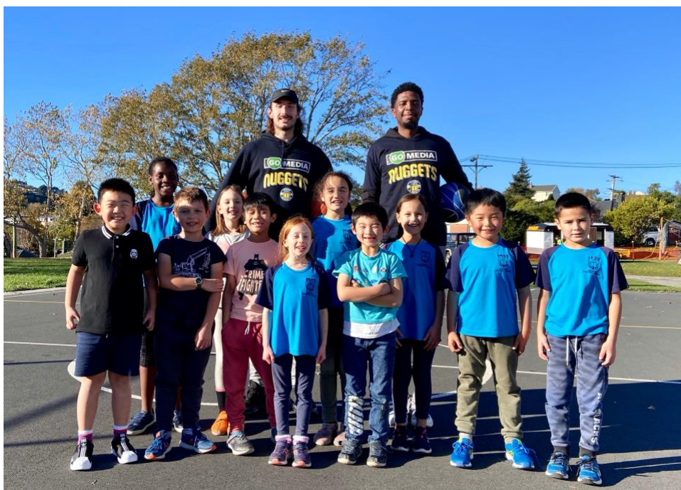
Otago Nuggets session with our Year 3&4 Basketball Team