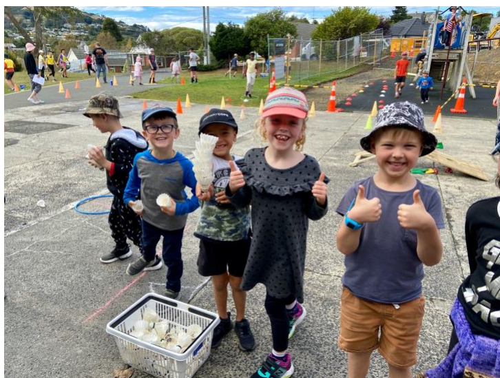
Year 8 Fun Day end of term 1