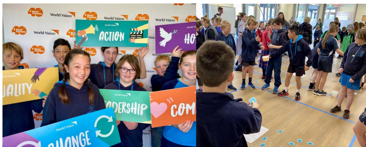
World Vision Youth Conference