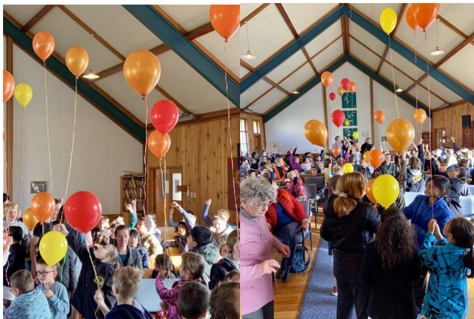
The Pentecost Service at St Mark's Church this week.