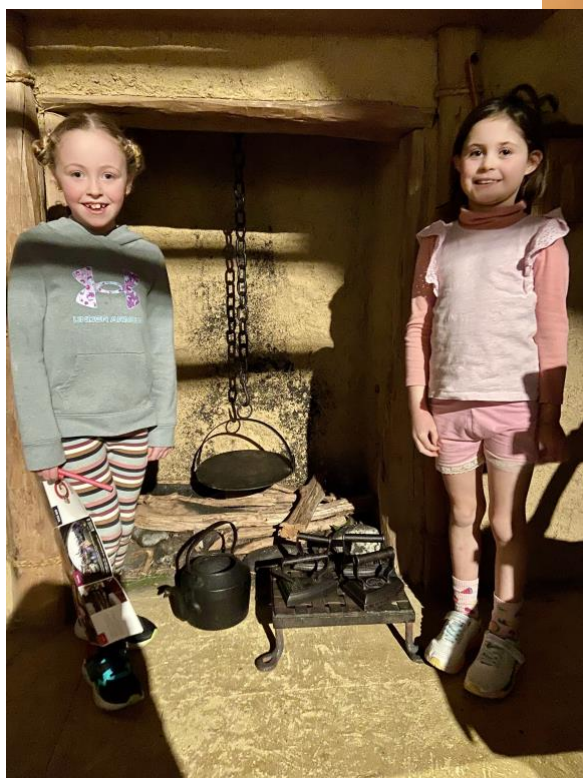
Year 1-4 students visited the Toitū Otago Settlers Museum this week.