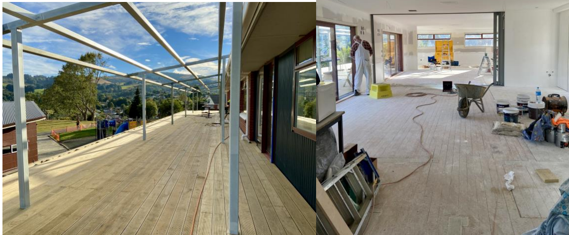
Rooms 1 & 2: The deck from the office end and inside painting progress.