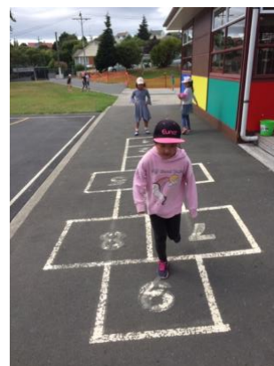
Juniors playing hopscotch