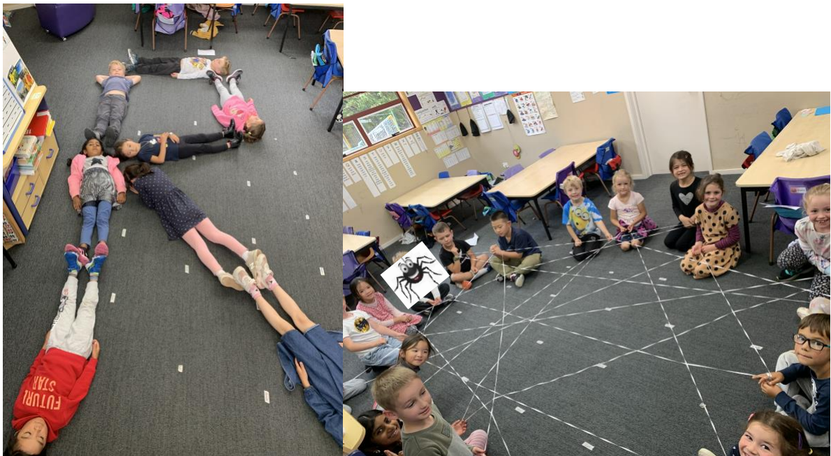
Room 3: learning about the letter R, and how and why a spider makes a web