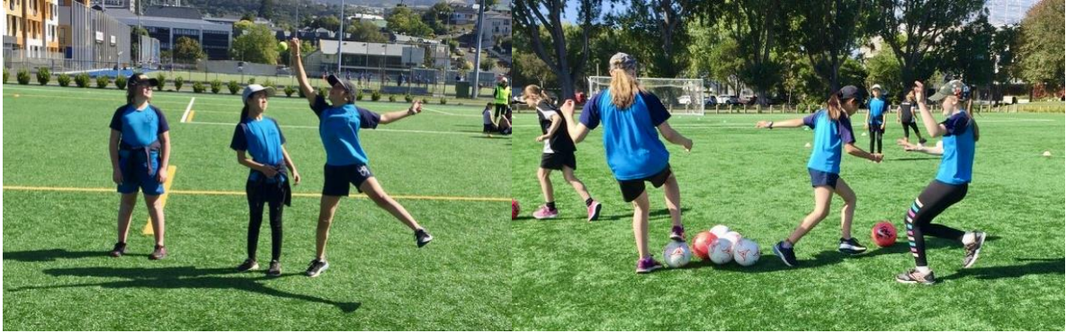
Year 7&8 girls at the Girls Sports Day