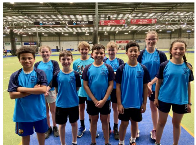
Year 5&6 and Year 7&8 Rippa Teams