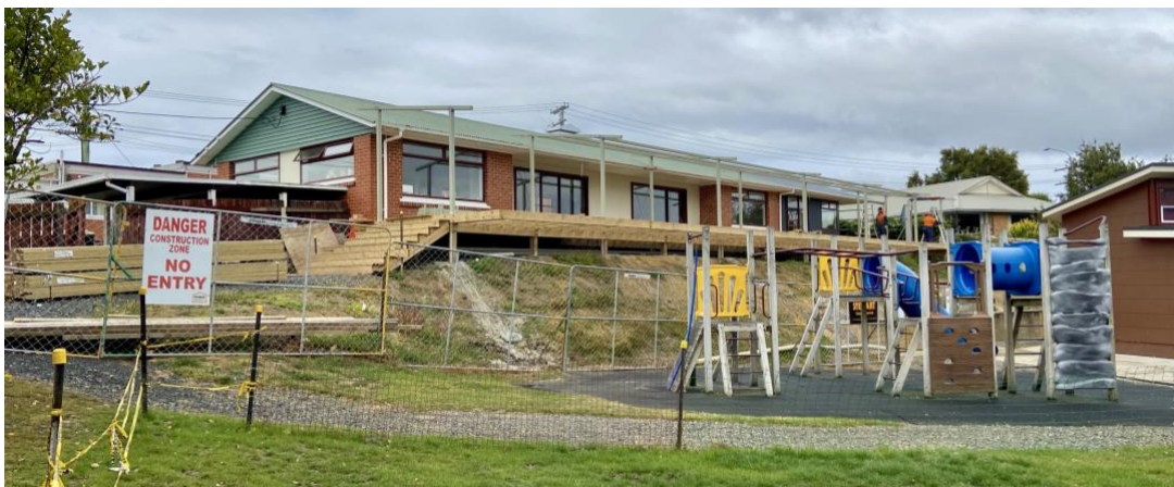
ABOVE: Our new classrooms are coming along on schedule!