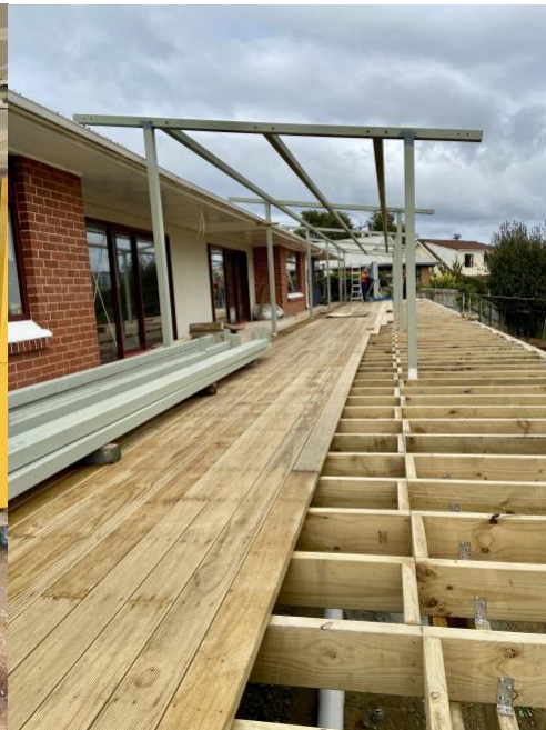
The new classrooms and deck are coming along nicely!