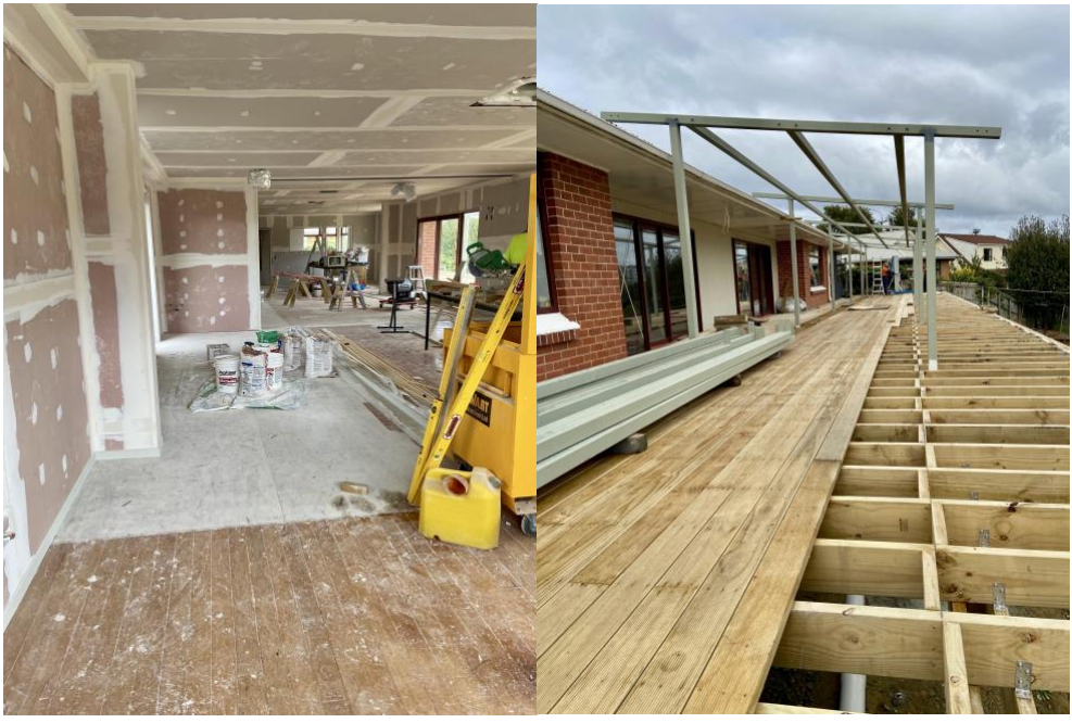
The new classrooms and deck are coming along nicely!