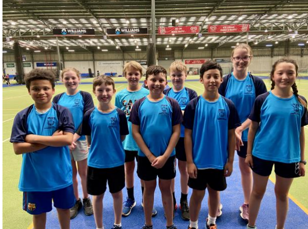
Year 5&6 and Year 7&8 Rippa Teams