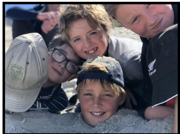
ABOVE: Beach Education.