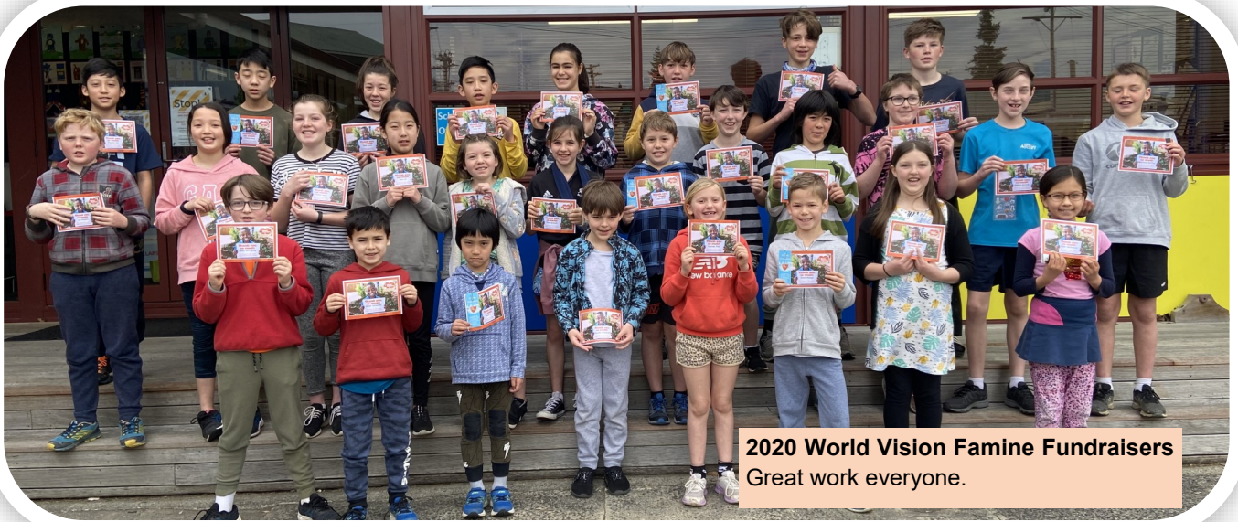
2020 World Vision Famine Fundraisers Great work everyone.