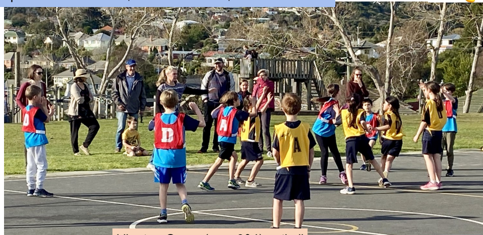
Liberton Green (year 3&4) netball team enjoyed a friendly game with NEV last week.