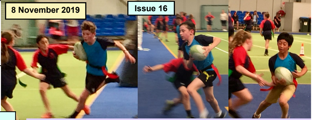
Rippa Rugby Teams are enjoying a competitive and exciting season this term.