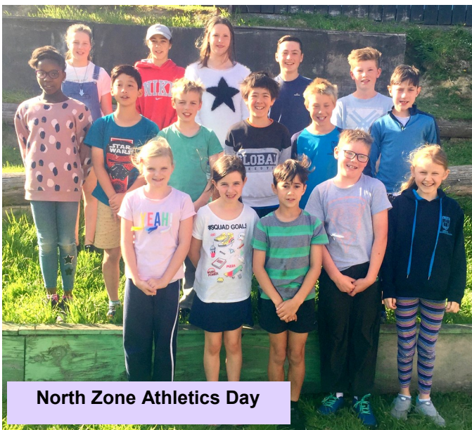
North Zone Athletics Day

Philippians 2:16 Holding fast to the word of life, so that in the day of Christ I may be proud that I did not run in vain or labor in vain.