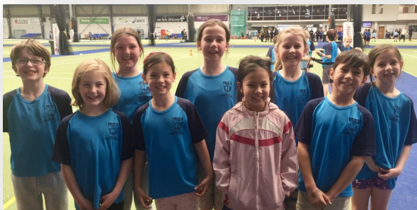
Liberton Lions—LCS Year 3-4 Rippa Rugby Team

A big thanks to all who ordered ham through the Christmas Ham Fundraiser. If you want to make an order and haven't—please have your form to school by Tuesday 29 October at the latest!