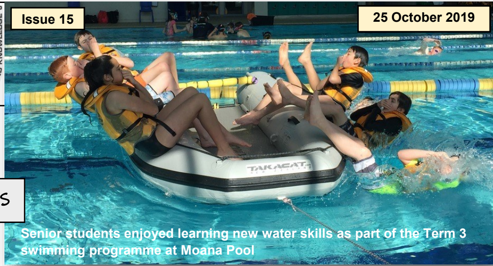
Senior students enjoyed learning new water skills as part of the Term 3 swimming programme at Moana Pool