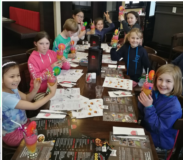
Winter sports teams have been organising end of season celebrations. Featured above is the Year 3 and 4 Netball team (Liberton Green)

The Liberton Fundraisers team are looking for new members. If this could be you, please contact the office and we will put you in touch!