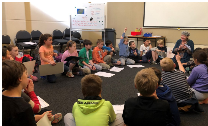
Room 2 and Room 4 enjoyed a day at the Toitū Otago Settlers Museum on Wednesday 5 June 2019.