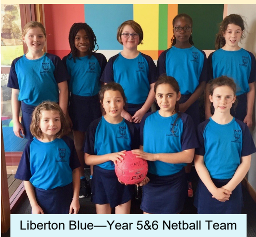
Liberton Blue—Year 5&6 Netball Team

Eph 4:32 "Be kind and compassionate to one another, forgiving each other, just as in Christ God forgave you."