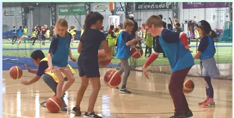
Our Year 3 and 4 students had fun trying out new skills during the 'Have a Go' Day at the Edgar Sports Centre on Monday 25 February

The Dunedin Christian Schools Association (DCSA) is holding its annual meeting on Tuesday 26 March at 7.45pm in the school staffroom. Members and friends of the school are encouraged to attend as we reflect on and celebrate together the previous year.