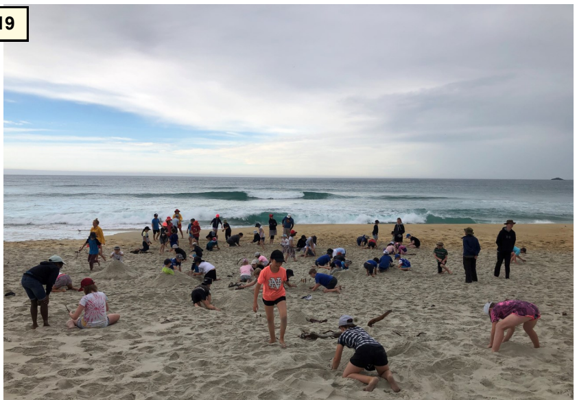
Beach Education Day was enjoyed by the Year 4 to 8 Students on Thursday 14 February.