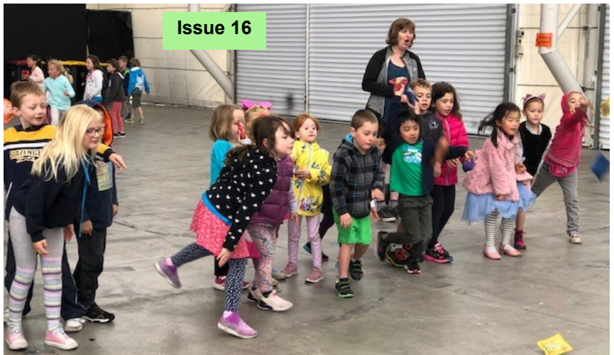
Year 1 to 3 students travelled to the Forsyth Barr Stadium to take part in the Fundamental Movement Skills Challenge Day on Friday 16 November 2018

Assembly on Friday 7 December will be our opportunity to thank various members of our community. Our graduation assembly will be held on Wednesday 12 December starting at 1.30pm, followed by afternoon tea. All welcome!