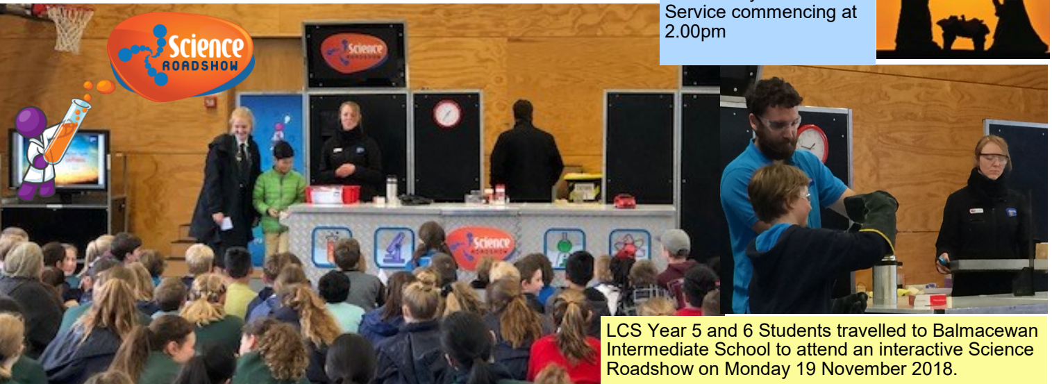
LCS Year 5 and 6 Students travelled to Balmacewan Intermediate School to attend an interactive Science Roadshow on Monday 19 November 2018.