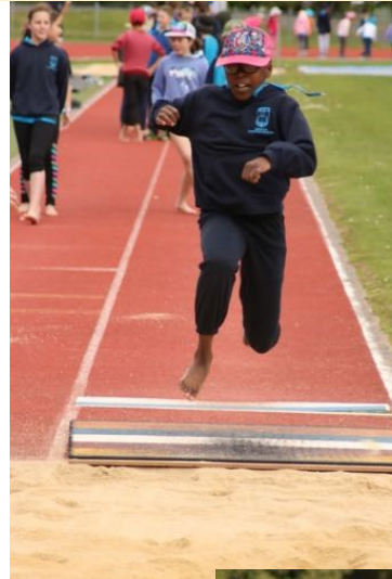
A great day for the LCS Athletics at the Caledonian Grounds on Tuesday 16 October 2018