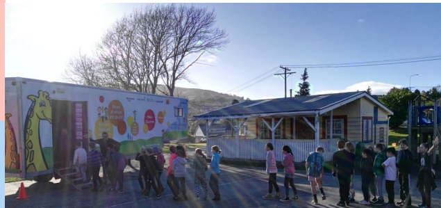
Students enjoyed a visit from the Life Education Trust on 25/26 June 2018.