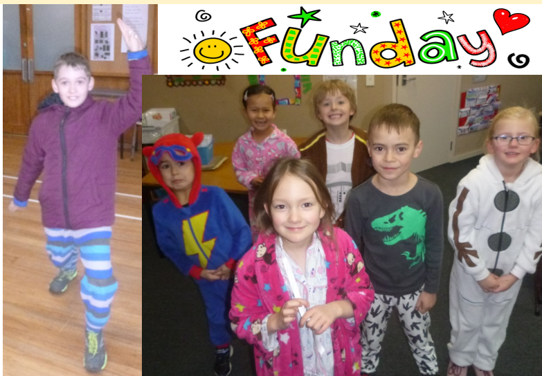
On Friday 8 June LCS had a Pyjama Day combined with a 'Fun Afternoon' organised by our year 8 students.