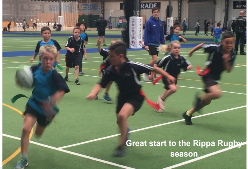
Great start to the Rippa Rugby season