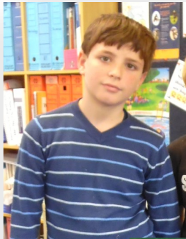
February 2014—December 2017