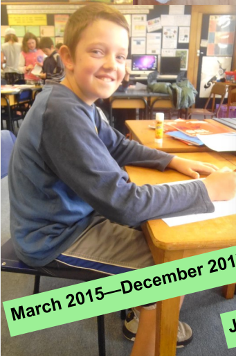
March 2015—December 2017