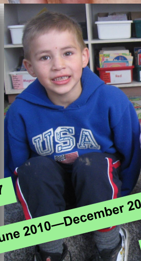
June 2010—December 2017