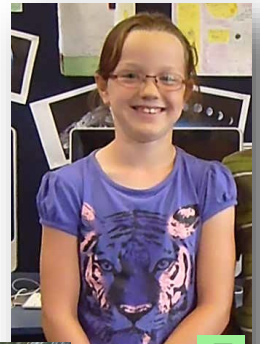
February 2014—December 2017