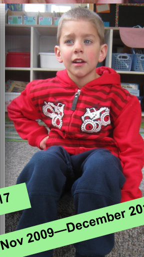
Nov 2009—December 2017

being CONFIDENT of this WHO BEGAN A THE Good Work IN YOU will carry it on to COMPLETION UNTIL THE DAY OF CHRIST JESUS ~ PHILIPPIANS 1:6 ~