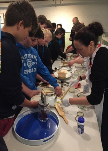
Year 5-8 enjoyed a visit to Olveston Historic Home on Tuesday 21 November