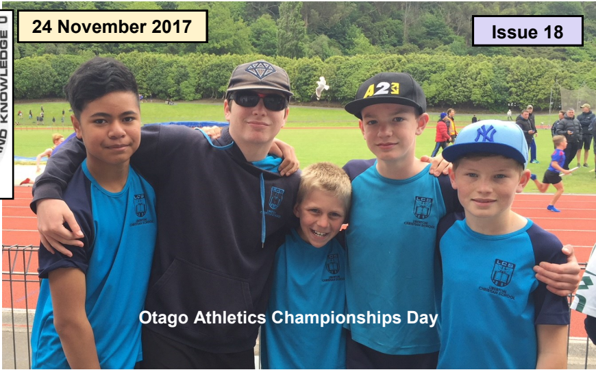
Otago Athletics Championships Day